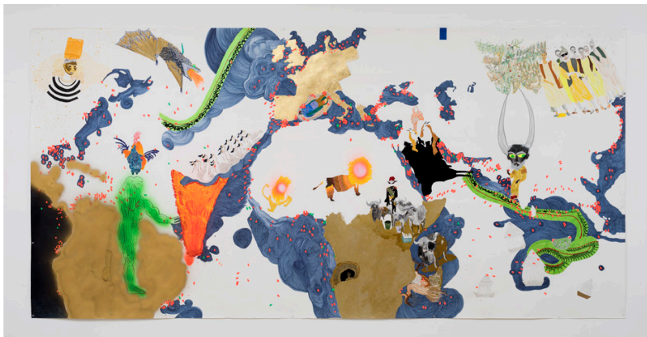
“The Iblis, the Girl, the Sultan and the Lion’s Tail,” mixed media on paper, 2017

From 2015 to 2016, the multidisciplinary artist Elham Rokni asked Sudanese and Eritrean refugees living in Israel to share with her folktales from their home countries. Rokni, who was born in Iran and immigrated to Israel at the age of nine, included eighteen of the aforementioned stories in an artist book entitled “The Iblis, the Girl, the Sultan and the Lion’s Tail.” The tales are presented side by side with vibrant drawings created by Rokni, offering imaginative visual interpretations of the texts. The folktales from Eritrea and Sudan appear in the book in four languages – in Hebrew and in English, as well as in the storytellers mother tongues: Arabic and Tigrinya.