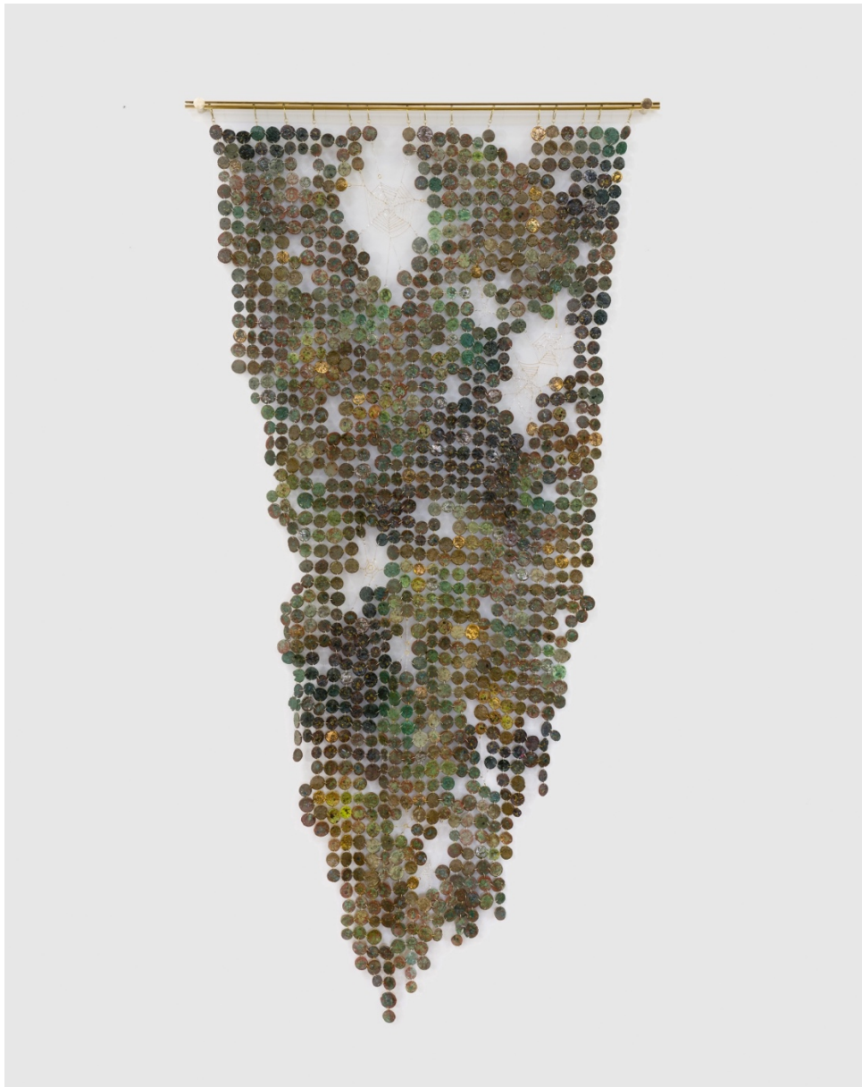
Cammie Staros , Undercurrent , 2023. Glazed ceramic, gold, silver, brass, 71 x 36 x 2 in.

The most delicate and fascinating works are coin "tapestries." To create these intricate pieces, Staros first cast and then glazed hundreds of irregular coin-shaped ceramics so they resemble ancient, corroded treasures. These were later assembled into expansive flat reliefs that are held together with thin bits of gold and silver wires and interspersed with elaborate and intricate web-like chains. Rather than all the coin works displayed on the walls, the largest, Undercurrent is suspended to function as another barrier along with the unfinished metal studs. The interweaving of the coins and spider webs draw parallels between presence and absence, past and present, and the fragility and vulnerability of living beings as symbolized by the seeming presence of ancient artifacts.