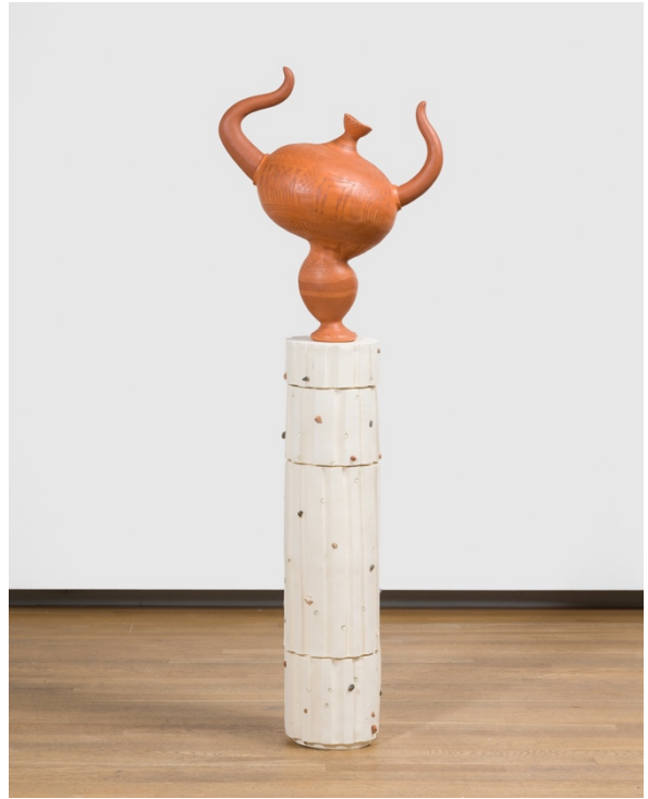
Cammie Staros, Half Beast , 2023. Ceramic, pebbles, and shells, vessel: 25 x 21 x 12 in, vessel with pedestal: 61 x 21 x 12 in.

In contrast to these delicate ceramic forms, Staros also created a number of life-sized carved travertine sculptures that appear to be fragmented human figures. Cora Kore presents the bottom half of a draped figure on a rectangular limestone pedestal. The arm is cropped above the elbow and connected to nothing. The hand grabs hold of the folds of a robe or gown. The figure's neck and head are left to our imagination. A similar disorientation occurs in Cult Classic , Staros' abstracted and sensual representation of a partial torso. Though made of marble, these sculpted forms are etched with lines that give them an airiness while also alluding to flowing lava, melting ice, or running water.