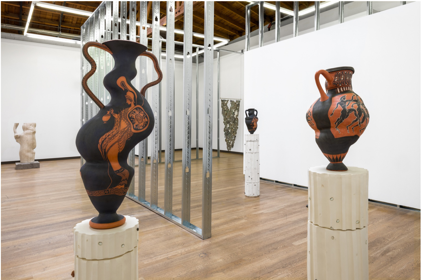
Cammie Staros: Monster in the Maze , September 16–October 28, 2023. Shulamit Nazarian, Los Angeles.

For her exhibition Monster in the Maze , Cammie Staros has transformed the normal pathways of the gallery into a maze-like display consisting of bare metal studs and a number of new walls of mixed heights which direct the viewer's trajectory. This labyrinth not only segments the exhibition, but also allows for unusual sight lines and juxtapositions. As Staros presents three different kinds of works, all based on classical Greek artifacts (vessels, coins, marble sculptures), the display comments on the ways archeological relics and classical sculptures are presented in museums.