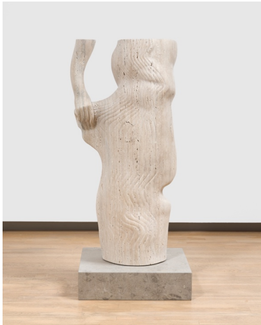
Cammie Staros, Cora Kore , 2023. Travertine on limestone, sculpture: 41 x 20 x 13 in, with pedestal: 46 x 20 x 20 in.

In contrast to these delicate ceramic forms, Staros also created a number of life-sized carved travertine sculptures that appear to be fragmented human figures. Cora Kore presents the bottom half of a draped figure on a rectangular limestone pedestal. The arm is cropped above the elbow and connected to nothing. The hand grabs hold of the folds of a robe or gown. The figure's neck and head are left to our imagination. A similar disorientation occurs in Cult Classic , Staros' abstracted and sensual representation of a partial torso. Though made of marble, these sculpted forms are etched with lines that give them an airiness while also alluding to flowing lava, melting ice, or running water.