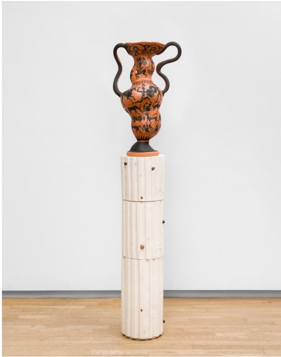
Cammie Staros, Attributed to: Human and Earth , 2023. Ceramic, pebbles, and shells, vessel: 22 ¼ x 13 ½ x 9 in, vessel with pedestal: 58 ¼ x 13 ½ x 9 in.