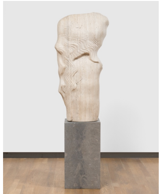
Cammie Staros, Cult Classic , 2023. Travertine on limestone, sculpture: 40 x 20 x 13 in, with pedestal: 64 x 20 x 13 in.