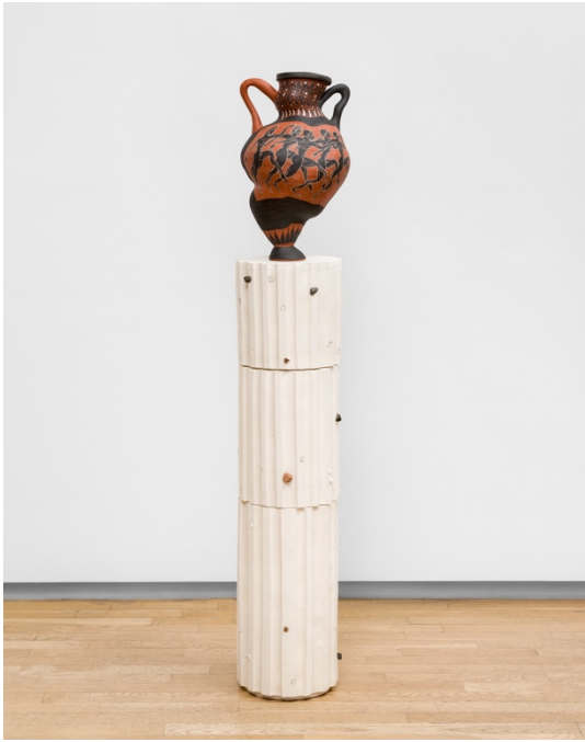
Cammie Staros, Prize Amphora / Trophy Cup , 2023. Ceramic, pebbles, and shells, vessel: 15 ½ x 9 x 9 in, vessel with pedestal: 51 ½ x 9 x 9 in. Courtesy of the artist and Shulamit Nazarian, Los Angeles.