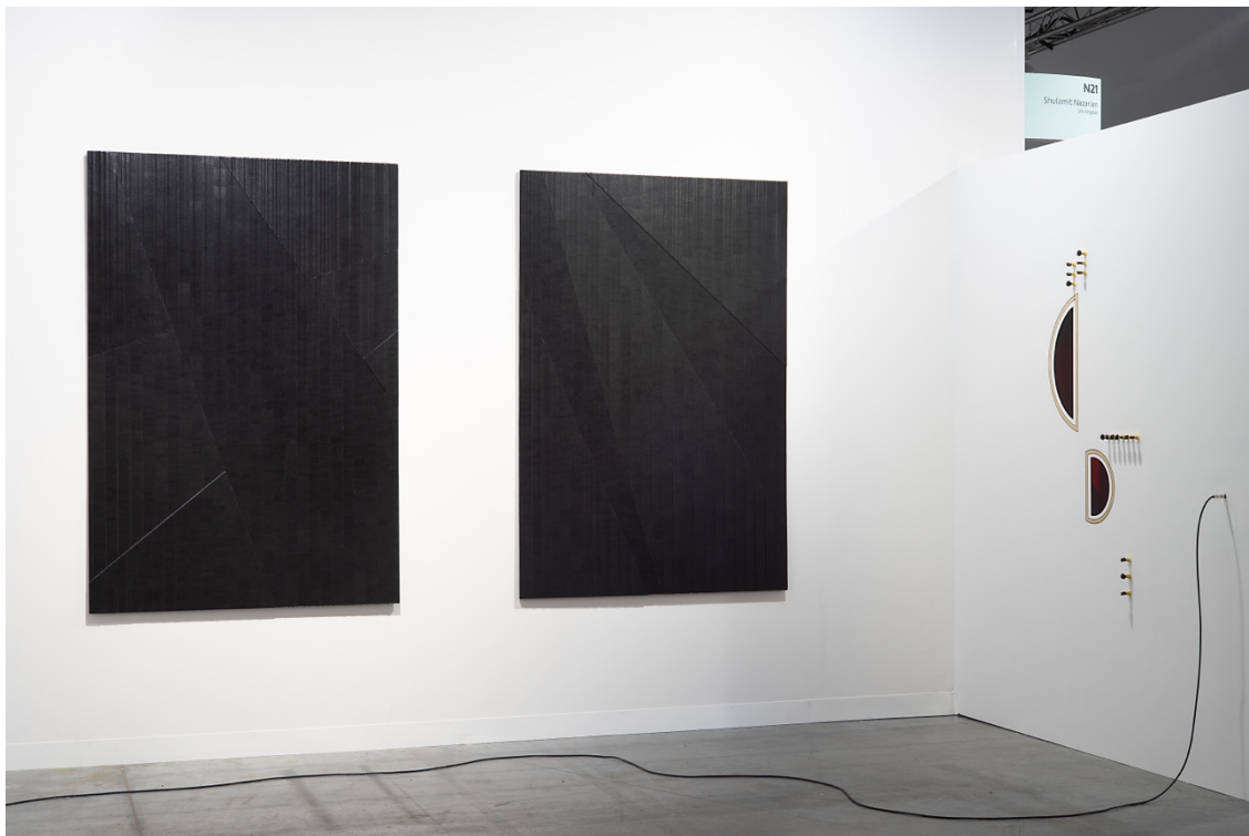
Installation view of Naama Tsabar at Art Basel: Miami Beach, Shulamit Nazarian, November 30 – December 4, 2021. Courtesy of the artist and Shulamit Nazarian, Los Angeles.

I’ve been using gaffer tape as a material since 2006. I find it super interesting because it’s a material that’s used on stages and production to stabilize cords but is hidden, it’s meant to blend in. It represents the labor behind the experience. For this specific work, I’m thinking about surfacing the tape and making it the show itself, the thing that reflects light. I want to focus light on the labor that’s associated with the material that facilitates the experience, to make it the experience itself.