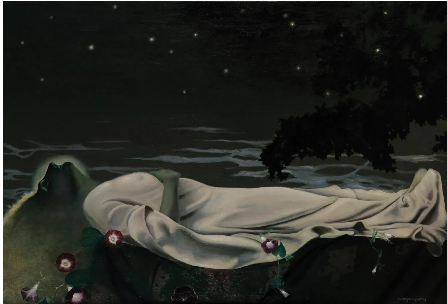
Clarence Holbrook Carter, "The Lady of Shalott" (1927), oil on canvas, 37 1/4 x 53 1/4 inches